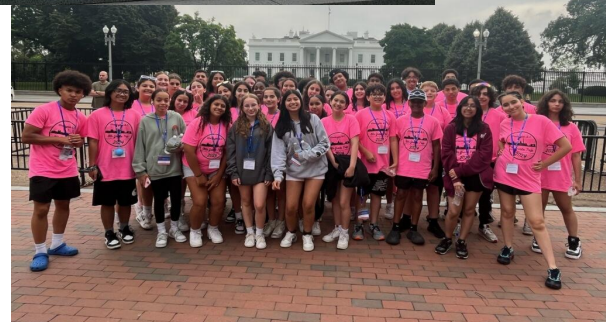
Grade 8 students enjoyed their trip to Washington, DC.